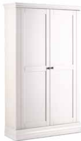
Narrow Wardrobe 224 Single hanging rail. Internal top shelf. H1970 x W1105 x D565 mm H77½ x W43½ x D22¼ in