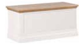
Blanket Box 220 H500 x W1040 x D500 mm H19¾ x W41 x D19¾ in