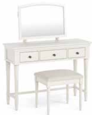
Dressing Table & Mirror Set 216 Only sold as a set. Dressing Table H810 x W1100 x D450 mm H31¾ x W43¼ x D17¾ in Mirror H500 x W700 x D50 mm H19¾ x W27½ x D2 in