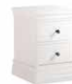
Narrow Bedside Chest 201 H535 x W385 x D425 mm H21 x W15¼ x D16¾ in