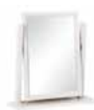
Vanity Mirror 174 H560 x W545 x D140 mm H22 x W21½ x D5½ in