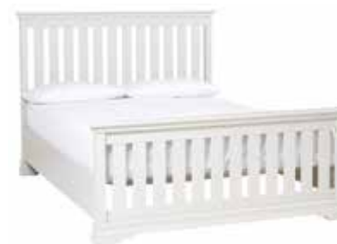
Imperial Bed King Size HFE (5') 242 H1250 x W1635 x L2185 mm H49¼ x W64¼ x L86 in