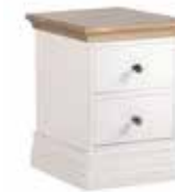
Narrow Bedside Chest 201 H535 x W385 x D425 mm H21 x W15¼ x D16¾ in