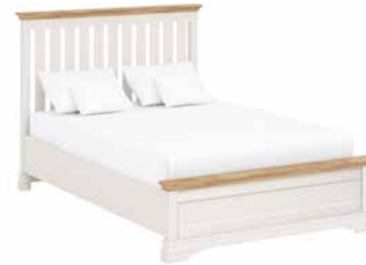
Imperial Bed Double LFE (4'6'') 241 H1250 x W1485 x L2070 mm H49¼ x W58½ x L81½ in