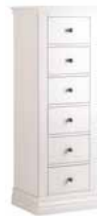
6 Drawer Tallboy 204 H1440 x W530 x D425 mm H56¾ x W20¾ x D16¾ in