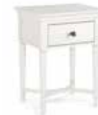
Nightstand 215 H620 x W470 x D390 mm H24½ x W18½ x D15¼ in