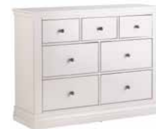
3+4 Drawer Chest 199 H950 x W1246 x D425 mm H37½ x W49 x D16¾ in