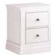
2 Drawer Bedside Chest 200 H610 x W530 x D425 mm H24 x W20¾ x D16¾ in