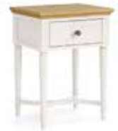
Nightstand 215 H620 x W470 x D390 mm H24½ x W18½ x D15¼ in