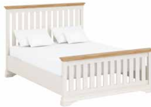
Imperial Bed King HFE (5') 242 H1250 x W1635 x L2185 mm H49¼ x W64¼ x L86 in