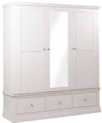
Triple Wardrobe with 3 Drawers 225 Two hanging rails. Two internal top shelves. H2020 x W1800 x D565 mm H79½ x W70¾ x D22¼ in