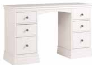
Double Pedestal Dressing Table 219 H820 x W1240 x D430 mm H32¼ x W48¾ x D17 in