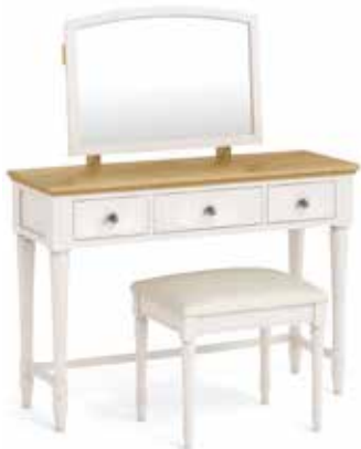
Dressing Table & Mirror Set 216 Only sold as a set. Dressing Table Mirror H810 x W1100 x D450 mm H500 x W700 x D50 mm H31¾ x W43¾ x D17¾ in H19¾ x W27½ x D2 in