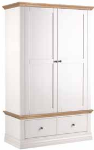
Double Wardrobe with 2 Drawers 223 Single hanging rail. H2030 x W1250 x D565 mm H80 x W49¼ x D22¼ in