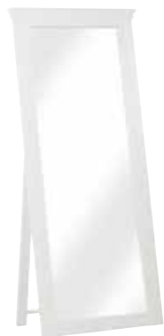
Cheval Mirror 178 H1680 x W710 x D440 mm H66¾ x W28 x D17¼ in