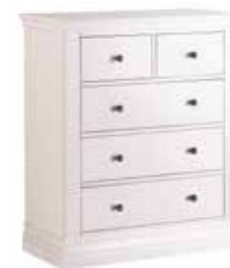
2+3 Drawer Chest 196 H1020 x W890 x D425 mm H40¼ x W35 x D16¾ in