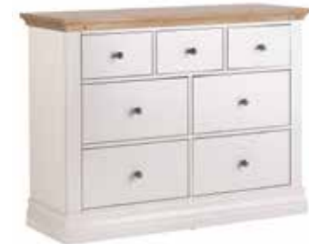
3+4 Drawer Chest 199 H950 x W1246 x D425 mm H37½ x W49 x D16¾ in