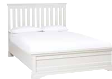
Imperial Bed Double LFE (4'6'') 241 H1250 x W1485 x L2070 mm H49¼ x W58½ x L81½ in