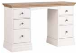
Double Pedestal Dressing Table 219 H820 x W1240 x D430 mm H32¼ x W48¾ x D17 in