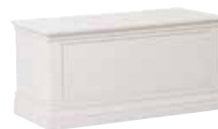
Blanket Box 220 H500 x W1040 x D500 mm H19¾ x W41 x D19¾ in