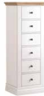
6 Drawer Tallboy 204 H1440 x W530 x D425 mm H56¾ x W20¾ x D16¾ in