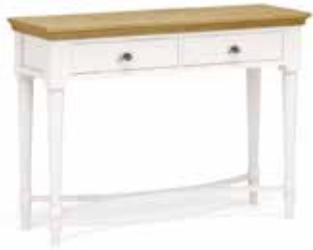
Console L144 H810 x W1000 x D400 mm H31¾ x W39¼ x D15¾ in