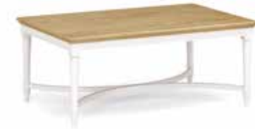
Large Coffee Table L142 H420 x W1100 x D700 mm H16½ x W43¼ x D27½ in