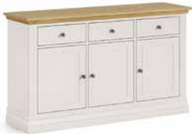
Large Sideboard L134 One fixed shelf in each cupboard. H860 x W1475 x D425 mm H33¾ x W58 x D16¾ in