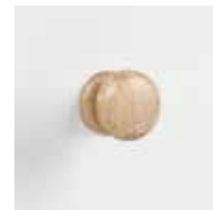
Wooden Button W