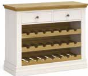
Wine Unit L137 H860 x W1040 x D400 mm H33¾ x W41 x D15¾ in