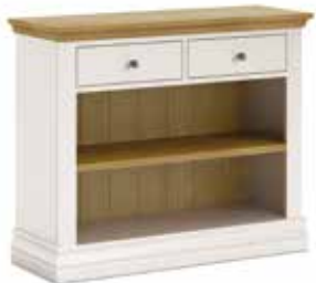
Bookcase L139 H860 x W1040 x D400 mm H33¾ x W41 x D15¾ in