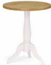
Side Table - Round L143 H620 x W525 x D525 mm H24½ x W20¾ x D20¾ in