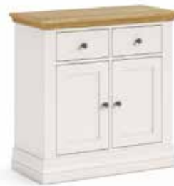
Mini Sideboard L136 One removable shelf. H860 x W850 x D400 mm H33¾ x W33¾ x D15¾ in