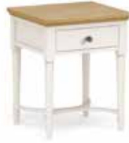
Lamp Table L140 H550 x W450 x D420 mm H21¾ x W17¾ x D16½ in