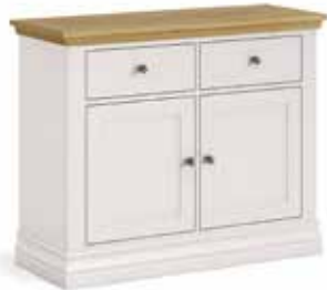
Small Sideboard L135 One fixed shelf. H860 x W1040 x D400 mm H33¾ x W41 x D15¾ in