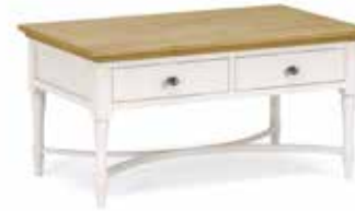
Coffee Table with Drawer L141 Two drawer. They can be opened from either side. H480 x W950 x D550 mm H19 x W37½ x D21¾ in