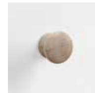
Wooden Button WL