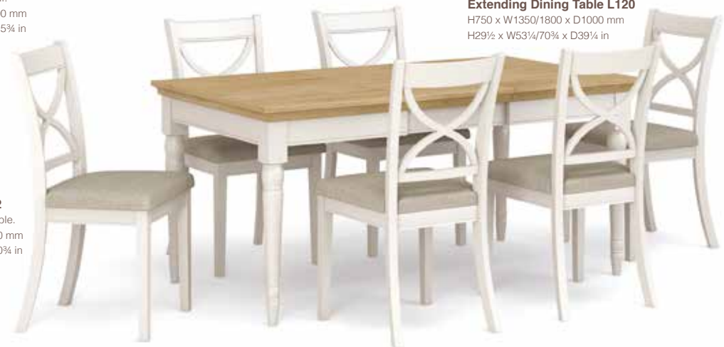
Dining Chair 122 Fabric choice available. H950 x W490 x D530 mm H37½ x W19¼ x D20¾ in